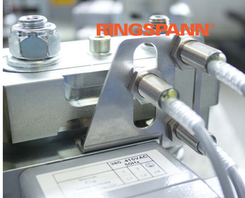
The monitoring of RINGSPANN's electric brakes records the state inquiries.